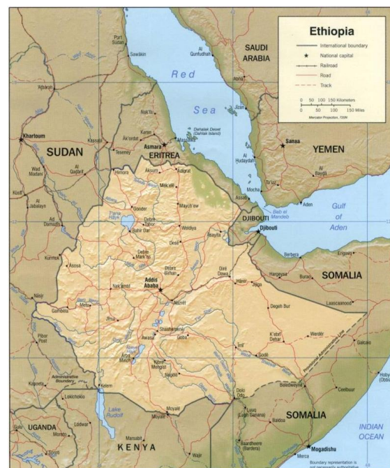
Figure 1 Shaded relief map of Ethiopia