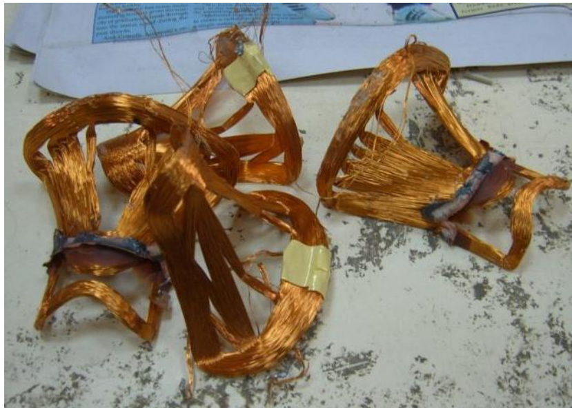
Photo 7 Pure copper retrieved from the yokes of CRTs