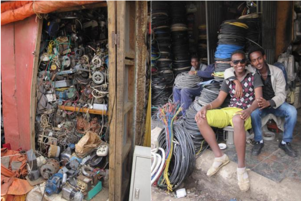
Photo 5 a & b Shops dealing with used EEE in Merkato Market, Addis Ababa