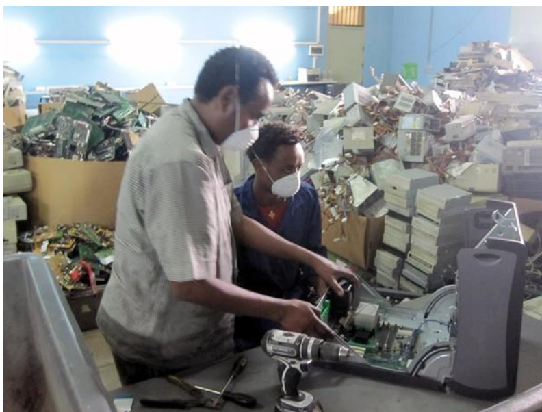
Photo 4 Computer dismantling in the Demanufacturing Facility in Akaki