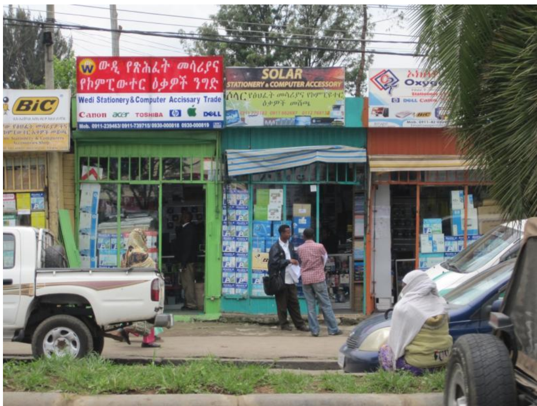
Photo 1 Electronic equipment retail shops in Kazanchis, Addis Ababa

over urban Ethiopia. In Addis Ababa, one major distribution cluster is located in the Kazanchis area, where more than 100 shops sell new and used electronic products such as printers, copy machines, computers and mobile phones.