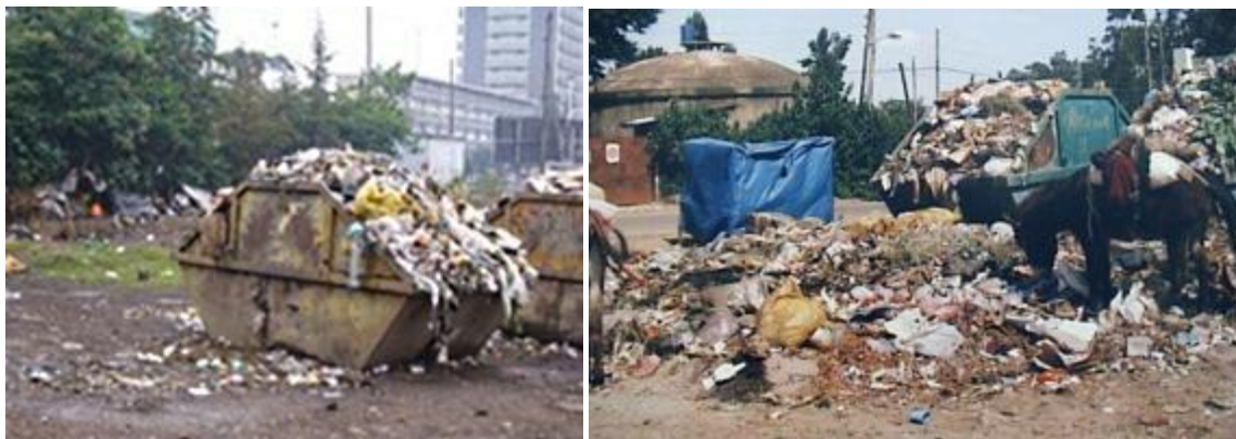
Photo 2 a & b Filled solid waste containers

Waste collection in Ethiopia is mostly restricted to urban areas. The following analysis is based on Addis Ababa, though the levels of organization and infrastructure vary between cities. 16